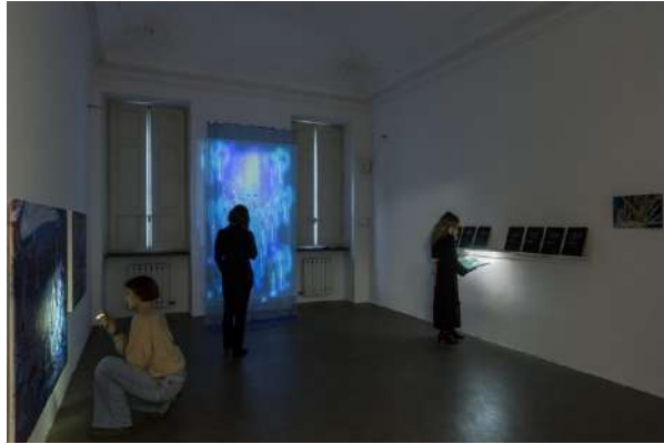
Lauren Wy, Chaos Angel, Simóndi Gallery 2025

Tra profezie, elementi elaborati digitalmente in grado di rispondere alle domande del visitatore, racconti per immagini, simboli e colori, si delinea, così, un mondo alternativo, capace però, come sempre accade nell'arte, di raccontare molte angosce e necessità del nostro.